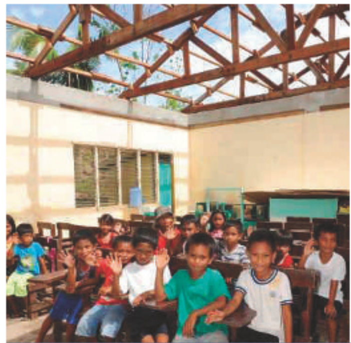
Biton elementary School where the roof was re-built

the night to ensure all aircraft were ready for the next day and, of course, the Ship's watch-keepers including engineers, chefs and navigation personnel, who not only got us to the Philippines in the first place but have also kept her running and safe whilst here.