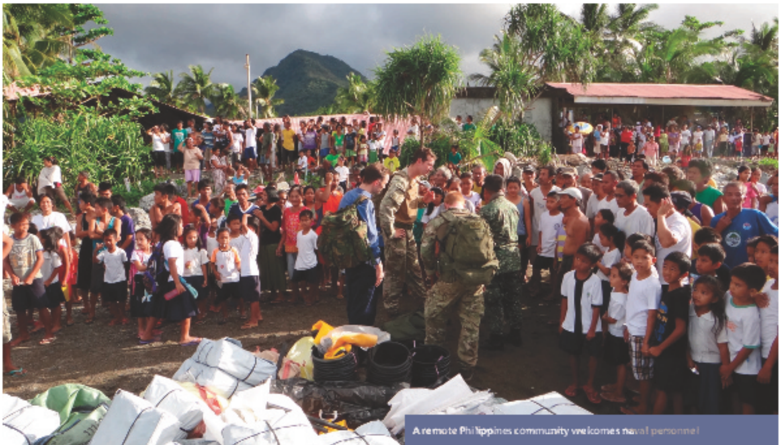
A remote Philippines community welcomes naval personnel