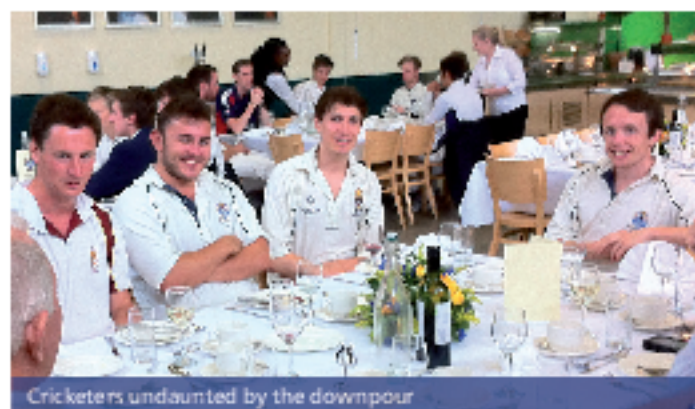
Cricketers undaunted by the downpour