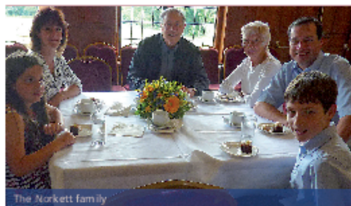
The Norkett family

The heavens may have opened causing the cricket to be cancelled but the annual reunion day was enjoyed hugely by Old Blues from the 1980s and by those from before 1960.